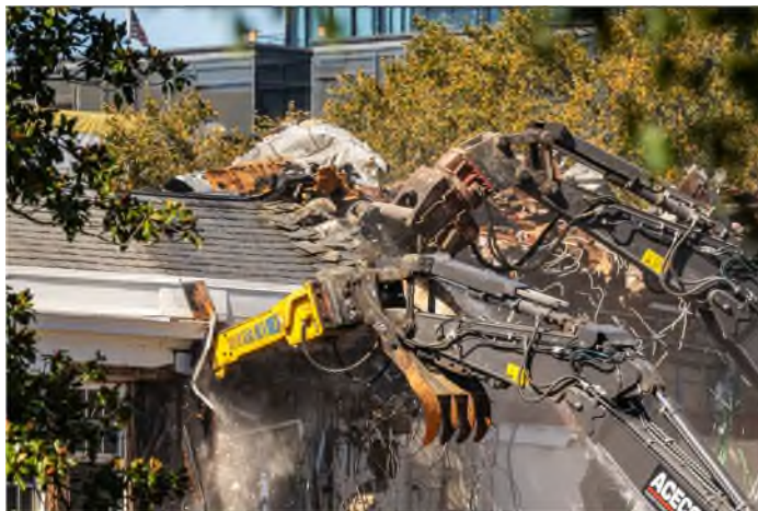
Figure 9 – Demolition of the East Wing of the White House.

49. On October 21, 2025, various media outlets reported on the demolition of the East Wing. Images published by the New York Times showed heavy machinery tearing down the East Wing’s façade.