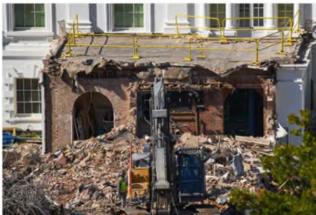
Figure 14 – Photograph of debris at the East Wing taken on October 23, 2025.

62. And photographs taken from near the White House showed the demolition of nearly the entire East Wing and east colonnade.