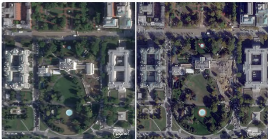
Figure 12 (left) – Satellite photograph of the White House and grounds taken on September 26, 2025.

61. A satellite photograph likewise depicted cleared space where the East Wing previously stood.