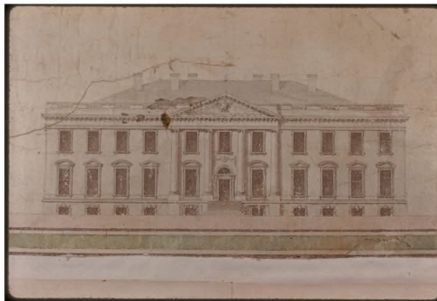
Figure 1 – Plan drawn by James Hoban circa his 1793-1794 designs for the White House.

22. Conceived by the capital's initial planner, Pierre Charles L'Enfant, as a grand presidential palace, the White House owes its modest yet iconic profile to James Hoban, an Irish-born architect whose winning submission to an architectural competition served as the plans for the new building. Hoban's surviving sketches depict a structure, on the scale of what would then have been a large country house, that substantially resembles the Executive Residence today.