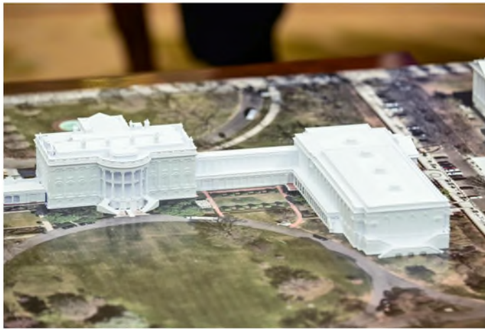
Figure 10 – Three-dimensional rendering of the Executive Residence and of the planned Ballroom displayed by President Trump in the Oval Office.

55. The next day, October 22, 2025, President Trump showed renderings of the Ballroom to members of the press and other persons gathered in the White House during a meeting with NATO Secretary General Mark Rutte. A three-dimensional model on a table in front of President Trump displayed the Ballroom on the site of the East Wing.