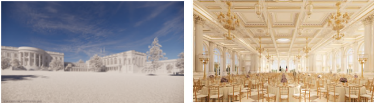
Figure 7 (left) – Rendering of the exterior of the planned Ballroom. July 2025 Press Release.

35. Included at the bottom of the July 2025 Press Release was a series of six images. Five of the images appeared to depict a structure on the east side of the White House, roughly on the site where its East Wing then stood. The structure shown in the images was substantially larger than the East and West Wings, and out of proportion to the Executive Residence to which it appeared to be attached. The sixth image depicted what was presumably the interior of that structure—a large room with oversized windows and gold trim on the ceiling.