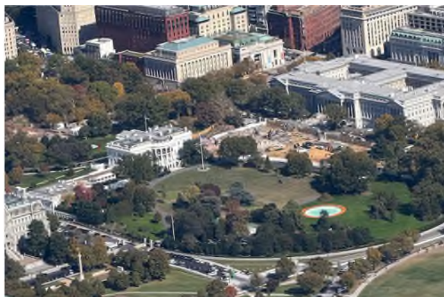
Figure 11 – Aerial photograph of President’s Park and the surrounding area on October 23, 2025. The site of the former East Wing is to the right of the remainder of the White House.

60. Within days, the Defendants had demolished the entirety of the East Wing. An aerial photograph taken on October 23, 2025, reflected the demolition of the East Wing and the east colonnade.