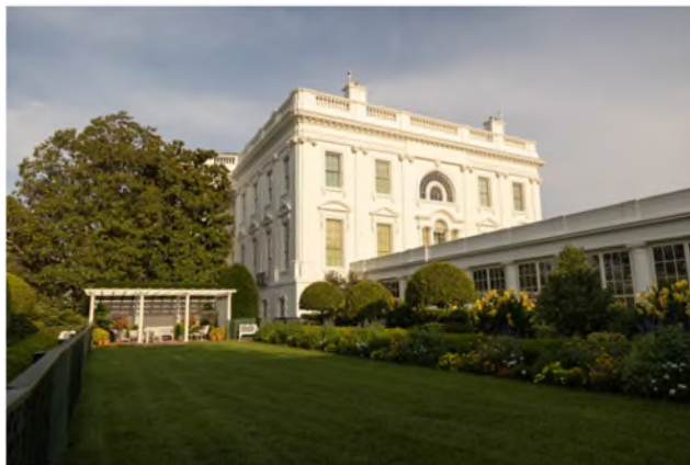
Figure 5 – Jacqueline Kennedy Garden (2023).

30. Located on the grounds outside of the East Wing was a garden, constructed shortly after the East Wing itself. Dating to 1903, but dedicated to former First Lady Jacqueline Kennedy in 1965, the Jacqueline Kennedy Garden balanced the Rose Garden on the west side of the White House. The Jacqueline Kennedy Garden, depicted below, featured a defined central lawn bordered by a brick walk and various botanical specimens. A pergola designed by the architect I.M. Pei was located at its west end. Like the Rose Garden, the Jacqueline Kennedy Garden was used to host events and receptions. Along with the East Wing, the Kennedy Garden was demolished in its entirety by the Defendants.